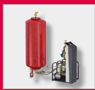
Flamcomat MP G4 <u>Expa</u>nsion Automat