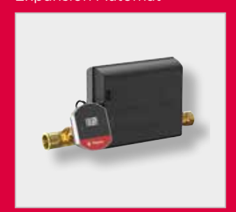
Flexcon PA Pressurisation Assistant