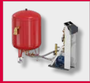
Flamcomat G4 Starter Expansion Automat