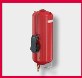
Flexcon MK-U Expansion Automat *