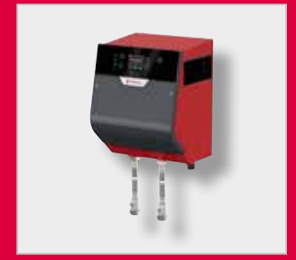
FlexFiller Mini Pressurisation Unit