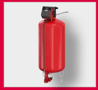
Flamcomat G4 MK-C Expansion Automat