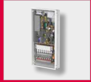
LogoMatic G2 Heat Interface Unit