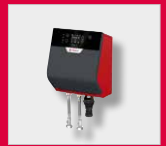
FlexFiller DIrect G4 Pressurisation Unit