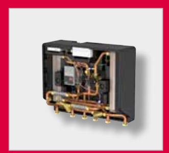
LogoEco G2 Heat Interface Unit