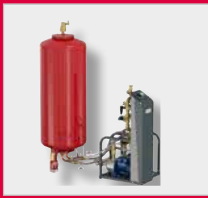
Flamcomat G3 Expansion Automat *