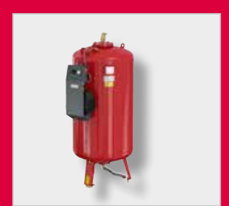
Flamcomat MK-U G4 Expansion Automat